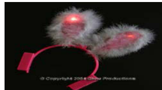
Bunny Ears $4