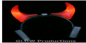
Flashing Devil Horn Bopper $4