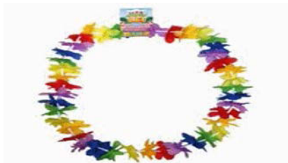
Flashing Hawaiian Lei's $4