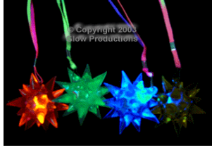
Flashing Spike Ball Necklace $3