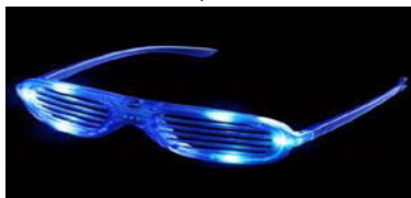
Flashing Shutter Glasses $5