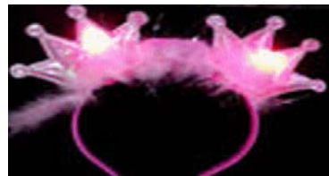
Flashing Princess Head Bopper $4