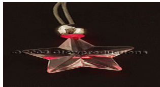
Flashing Star Necklace $3