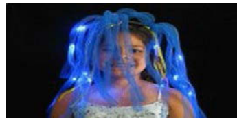
Flashing LED Dreadlock Head Bopper $5