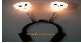
Flashing Skull Head Bopper $4