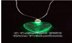
Flashing Heart Necklace $3