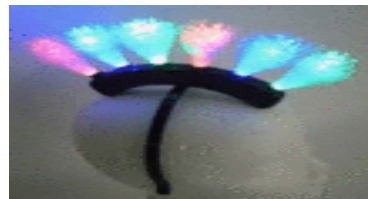
Fibre Optic Mowhawk Bopper $6