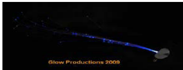
Flashing LED Fibre Optic Hair Braid $3