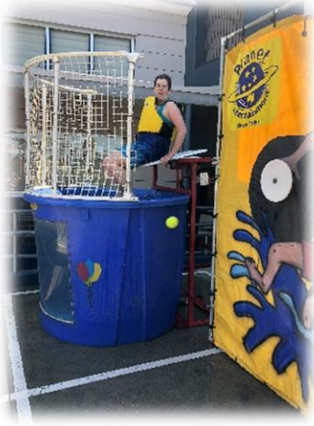
Dunk Tank FUN!!!