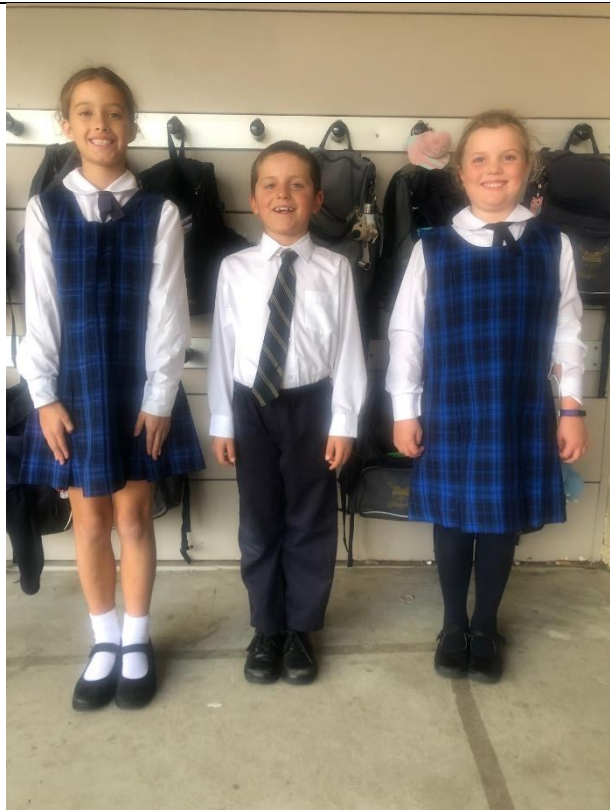
Winter uniform (hat should also be worn)