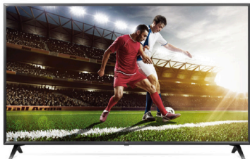
75" UHD LG TV

HERE ARE SOME OF THE FANTASTIC PRIZES TO BE WON: