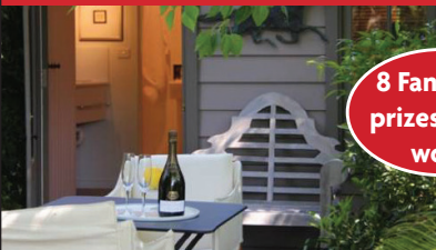
2 nights at The Shed in Bowral