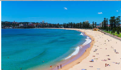
2 nights at Quest Apartments Manly