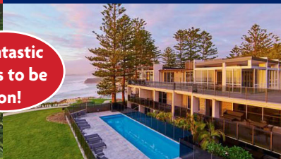
2 nights at Headlands in Austinmer Beach