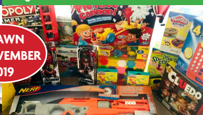
Fantastic Toy Hamper

To purchase your raffle tickets, please visit: www.rafflelink.com.au/stlucysraffle2019